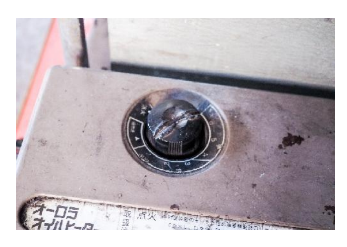
STEP 3 – Turn the dial to 1. This will cause a very small amount of kerosene to start leaking into the stove.