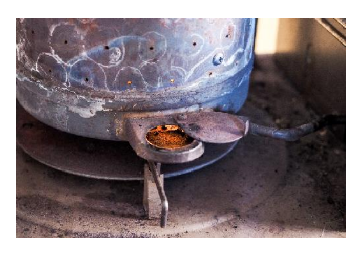
STEP 4 – Open the small cover to the ignition hole, light a match, and put the burning end of the match inside the ignition hole, up against the nozzle to the right of the entrance, inside the stove.