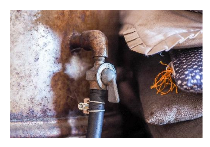
STEP 1 – Open the kerosene tank valve, turning the knob vertical.