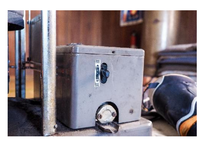
STEP 2 – Depress the 'Reset' switch down. You'll feel a 'click', and when you let go, the lever will return to its original position.